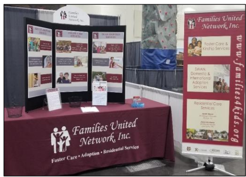
Recruitment of new families at an expo.

Our agency continues to expand across the state of Pennsylvania as we are located in Muncy, Scranton, Mount Joy, Mechanicsburg, Pittsburgh, Harrisburg, and Erie. In the past year, our North Central office, located in Muncy, has experienced the most growth, increasing the number of clients served by 30%! Due to this tremendous growth, the agency will be taking a look at options in the upcoming year for possibly expanding the office by adding an additional location. Our South Central office, located in Mechanicsburg has also experienced growth, particularly with kinship cases. In the past year, our workers have taken on the role of completing more emergency caretaker approvals when requested, which requires immediate case management and the licensing of the resource home within a 60 day timeframe.